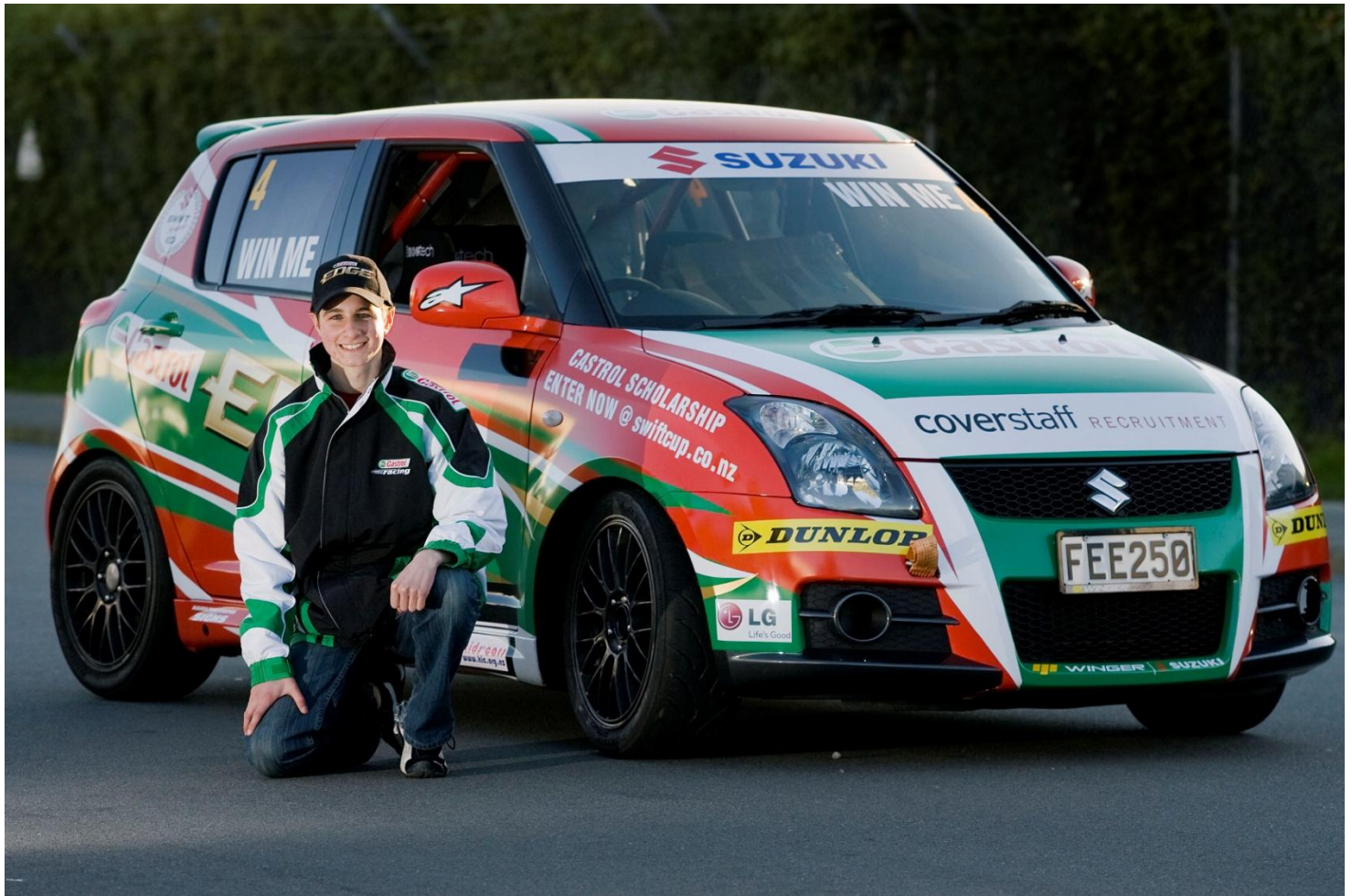
I will be racing this brand new Castrol backed Swift Cup car this season